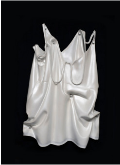
Camisole , Basswood, Paint, 13 x 21 x 3 D