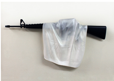
Insidious , Basswood, Paint, 18 x 38 x 3 D