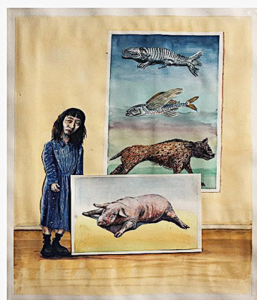
"The Biodevrsity Show #3 ",Watercolor on paper, 22" x 30"