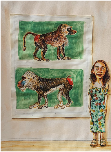
"In Front of Study of Baboons", Watercolor on paper, 15"x20"