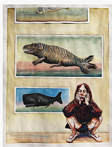
"The Biodevrsity Show #1 ",Watercolor on paper, 22" x 30"