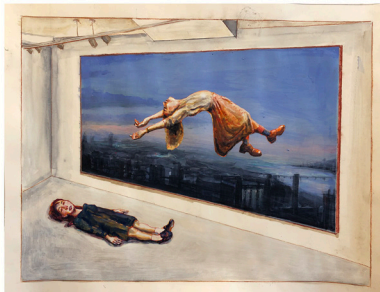
"The view from the floor", Acrylic and watercolor on paper, 28"x21"