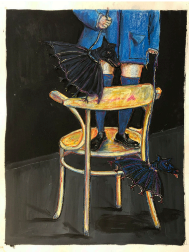
"Playing with Demons", Acrylic and Oil pastels on paper, 22.5"x30"

Zoom Reception Saturday, December 5th: 4-6pm and Gallery Appointments: 6-8pm