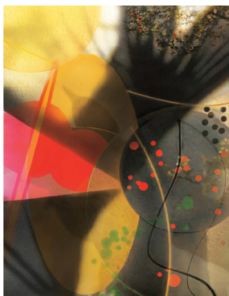
On Canyon Road #5 , plexiglass, latex ink, 32" x 25" x 1/4"