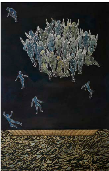
“Untitled” Oil on Canvas 48” x 30”