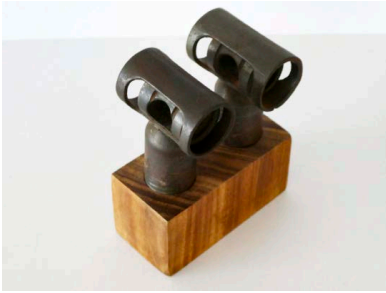
"Pieza I" Wood and Metal 8" x 4" x 10"