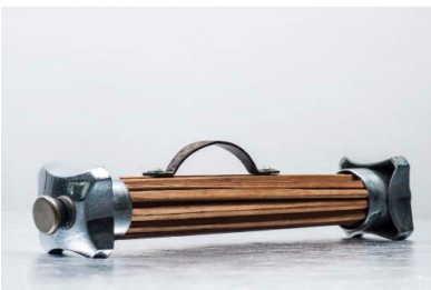
"Pieza VII" Wood and Metal 2" x 2" x 10"

Yamilé Bordón is a sculptor working with three dimensional readymade objects. Her series " Speculation " is about the transformation of everyday items into moments that are both personal and historical. She rejects a purely visual aesthetic in favor of a conceptually driven approach. Yamilé is fascinated by the fundamental and architectural beauty of regular objects rather than their functional use. By modifying, reassembling, deconstructing, reconstructing, and rotating these objects she is able to reinterpret their meaning based on their new context. She casts aside the original function and explores how the items exist in reality now that she has changed their form. Her process is fueled by the discovery of new ways to look at the piece in a three dimensional space.