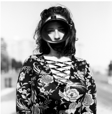
"Massy I" Gelatin Silver Print 15.9" x 15.9"