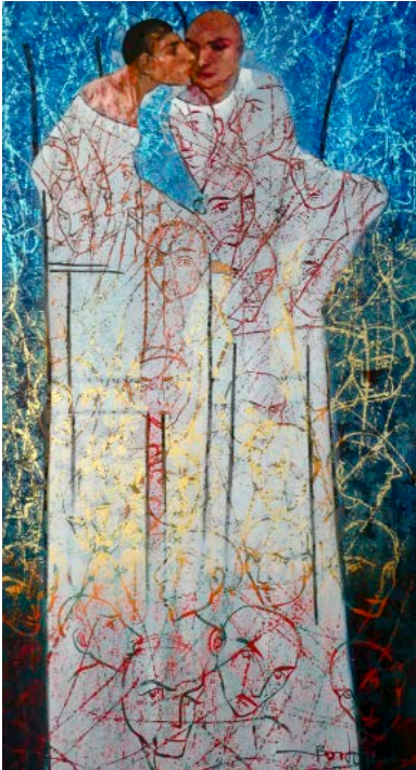
“Untitled” Oil on Canvas 70.7” x 37.4”