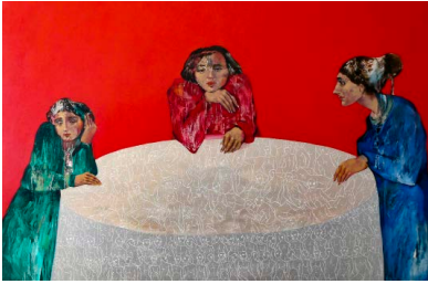
"Untitled" Oil on Canvas 76.4" x 51.2"