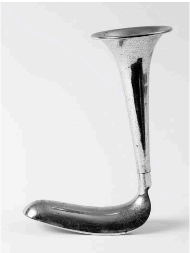
"Pieza IV" Metal Found Object 5.1" x 3.1" x 7.9"